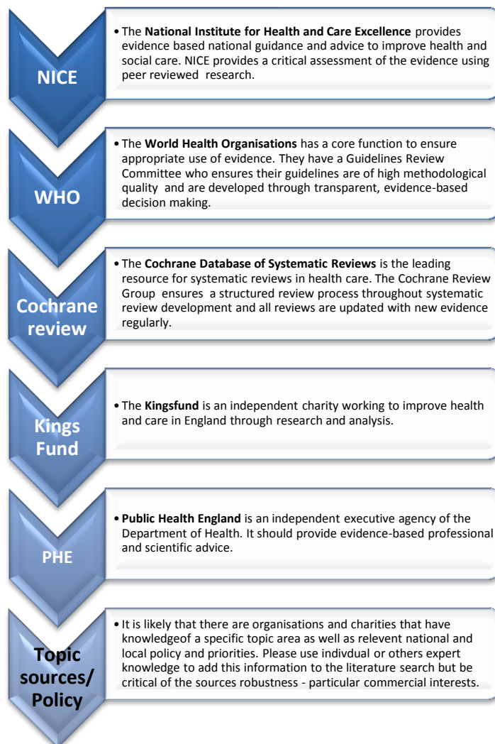
Figure 2: Minimum grey literature search

Health need/impact assessment – The literature review could be two-prong, including a review of health needs (particularly in the absence of local data) as well as a review of evidence based interventions designed to improve the health outcomes of a specific population. Again the literature review should influence the analysis and final recommendations of the assessment.